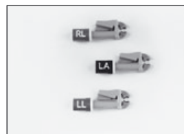
900178-103 Set Connector Grabber, 10 pcs., IEC 900178-203 14 pcs., IEC