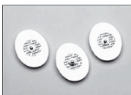
900703-230 SilverTrace disposable electrode adult, oval, foam, wet gel, 300 pcs 900703-205 SilverTrace Adult Stress Electrode, foam oval, wet gel, 600/case