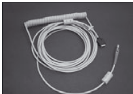
2016560-003 Patient cable coiled to CAM 14 Module MAC 5500ST, 4.6 m