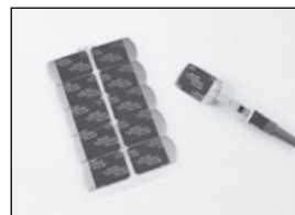
9623-003P Tab- electrode Silver Mactrode Plus, Silver/Silver Chloride, 1000 pcs. 9623-103P 1400 pcs.