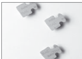
402207-210 BabyMac disposable infant Resting ECG electrodes, 500 pcs/case