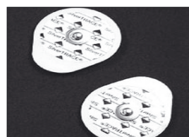
2014768-001 SILVERTRACE ELECTRODES MULTI P21MO FOAM OVAL W/ TAB 300/CASE