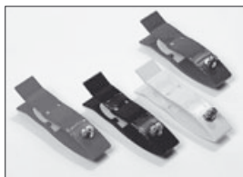
91920232 Set Clamp electrodes Adult/pediatric for limb leads, reusable, Set/4