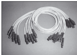
420101-001 Lead Wire MultiLink Universal, Mixed length, 14/set 420101-002 10/set