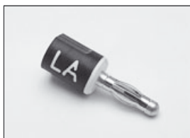
900178-101 Set Connector Banana 4mm, 10 pcs., IEC 900178-201 14 pcs., IEC