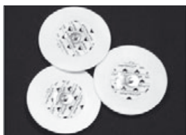
2014777-001 SILVERTRACE ELECTRODE P55MO Adult ROUND 300/CASE