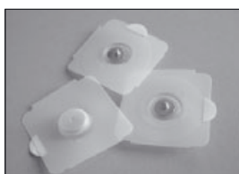
9653-305 SilverTrace Adult Holter/Stress Electrode, Vinyl tape round, solid gel, 300/case