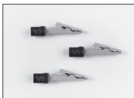
900178-102 Set Connector Alligator Clip, 10 pcs., IEC 900178-202 14 pcs., IEC