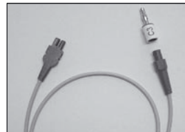
2001925-002 Lead wire MultiLink Universal, 74 cm 2001925-004 Lead wire MultiLink Universal, 130 cm