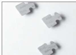
402207-210 BabyMac disposable infant Resting ECG electrodes, 500 pcs/case