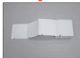
22616702 Recording Chart Paper Contrast, 10x360 sheet 22616802 Recording Chart Paper, box of 10 rolls

CE marking indicating compliance with the Medical Device Directive 93/42/EEC.