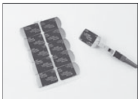
9623-003P Tab- electrode Silver Macrode Plus, 1000 pcs.