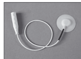
21717702 Adult Electrode, Yellow, limb and chest leads, 35 mm with 4 mm socket