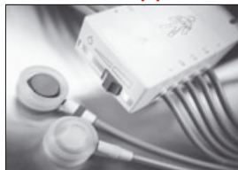
21612413 Electrode-Application system KISS 10, with pump