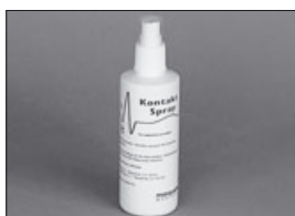
21730702 Electrode- Kontakt Spray, 10 bottles, 200ml/bottle