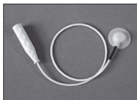
21711003 Electrode for children, 22mm diam., 4mm socket, reusable