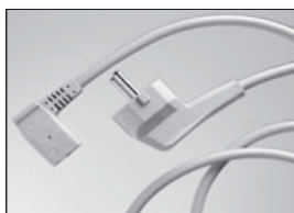
91920172 Power cord Euro, 2,5 m