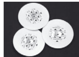
2014777-001 SILVERTRACE ELECTRODE P55MO Adult ROUND 300/CASE