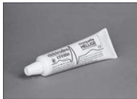
21708305 Electrode cream 10 tubes, 100ml