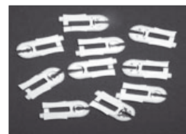
38401804 Adapter clip for electrode with Press stud, for leads with 4 mm plug, 10/pcs