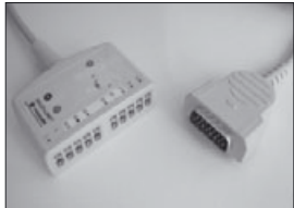
22341808 10-Lead MultiLink ECG cable, IEC, 2,5 m