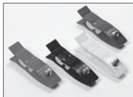
91920232 Set Clamp electrodes for limb leads, reusable, 4pcs. Red, Yellow, Green, Black 2011261-001 Electrode Clamp ECG Small (Infant), Set/4, Reusable