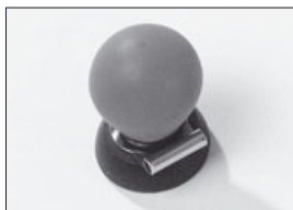
21714401 Chest suction electrode, reusable, Silver/silver Chloride