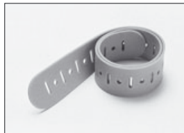
92309647 Strap for 50464856, 50 cm, 30 mm wide, latex-free