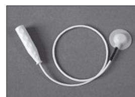
21711003 Electrode for children, 22mm diam., 4mm socket, reusable