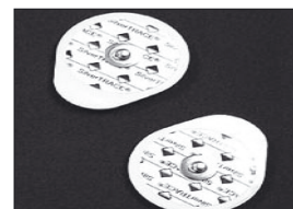
2014768-001 SILVERTRACE ELECTRODES MULTI P21MO FOAM OVAL W/ TAB 300/CASE