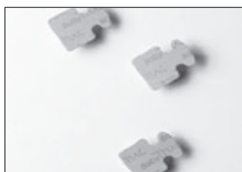
402207-210 BabyMac disposable infant Resting ECG electrodes, 500 pcs/case