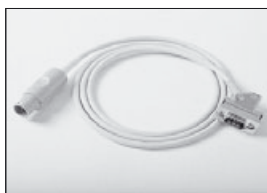
22338002 Cable connection to eBike & Ergoline 900

CE marking indicating compliance with the Medical Device Directive 93/42/EEC.