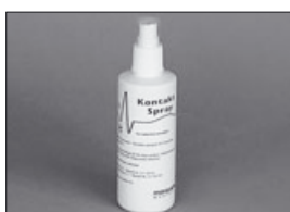
21730702 Electrode- Kontakt Spray, 10 bottles, 200ml/bottle