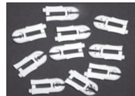
38401804 Adapter clip for electrode with Press stud, for leads with 4 mm plug, 10/pcs