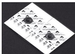
2014775-001 SILVERTRACE ELECTRODE P28MO Adult RECTANGLE 300/ CASE