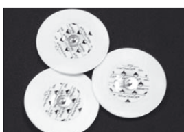
2014777-001 SILVERTRACE ELECTRODE P55MO Adult ROUND 300/CASE