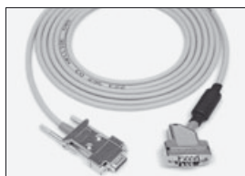
22336203 Cable connection to Cardisoft and PC, 5 m, RS 232