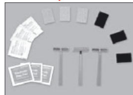
4828-005 PREP STRIP SANDPAPER, 100/BOX 9386-001 PREP PAD SCRUBBER, 200/PKG