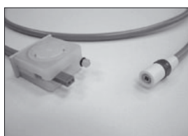
38401590 Leadwire Set/10 for KISS Application System