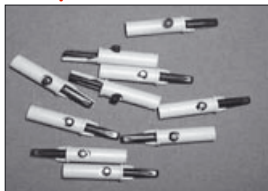
9490-105 Set Adapter Grey/Black Alligator/Banana socket 4mm, 10/set