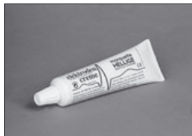
21708305 Electrode cream 10 tubes, 100ml