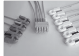
38401808 Leadwire Set/10, Grabber connector, 70 cm, IEC 414556-004 Set/5, Grabber connector, R,L,F,N,C, 130 cm, IEC