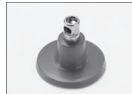
21719401 Chest- electrode, reusable 21719601 Electrode belt for 21719401