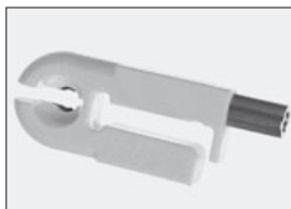
30344421 Adapter clip for disposable electrodes to KISS