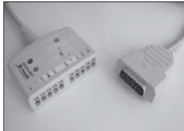
22341808 10-Lead MultiLink ECG cable, IEC, 2,5 m