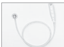
21722503 Electrode for babies, 13mm diam., 4 mm socket, reusable