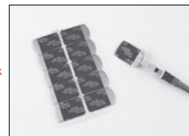
9623-003P Tab- electrode Silver Mactrode Plus, 1000 pcs.