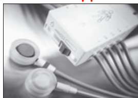
21612113 Electrode-Application system KISS 10, with pump