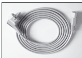
91906200 Power cord Euro