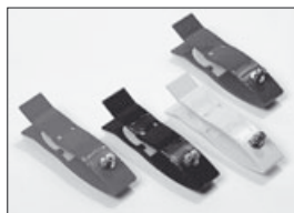
91920232 Set Clamp electrodes for limb leads, reusable, 4pcs. Red, Yellow, Green, Black 2011261-001 Electrode Clamp ECG Small (Infant), Set/4, Reusable