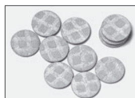
93204775 Filter Disks for KISS Application System