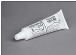
21708306 Electrode gel, 10 tubes, 100ml