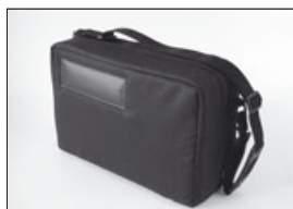
93109939 Instrument bag