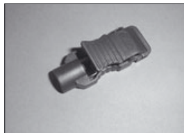
9490-210 Adapter for tab-electrodes, 10 pcs.