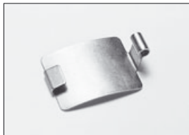
50464856 Limb- lead electrode, stainless steel, 30x 40mm