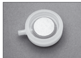
21732801 Suction Electrodes complete with Dome, for KISS