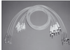
38401816 Leadwire Set/10, 4 mm Banana connector, 70-130 cm, IEC